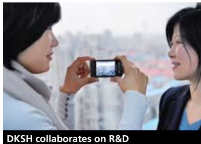
DKSH collaborates on R&D

One customer of DKSH, a US maker of mobile phones, was seeking to develop new technology for electro-luminescent back-