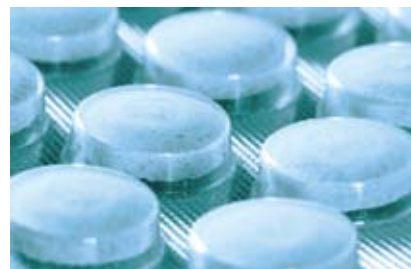
Pharma products speed to market

One business partner of DKSH was searching for a new customized substance that was not available on the market at the time. Knowing DKSH's ability to support its partners, it asked the company to help, using