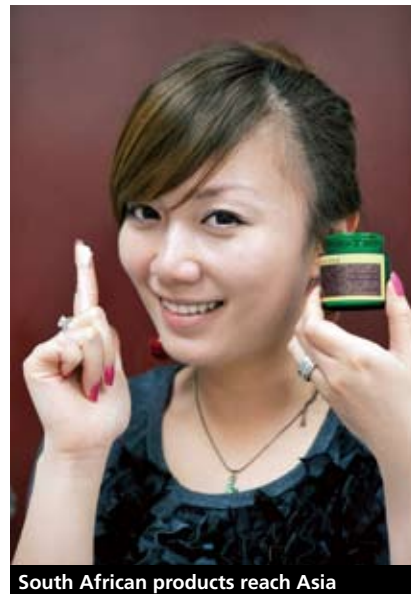
South African products reach Asia

The manufacturer as a result has gained industry-wide acknowledgment and its offerings have become part of the products of several leading companies in the cosmetics sector. DKSH acts as the client's sole partner for importation and distribu-