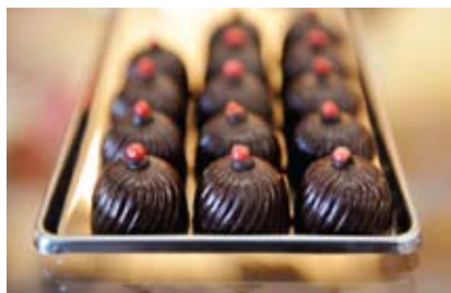
Chocolatiers benefit from DKSH sourcing

DKSH's business model of providing Market Expansion Services for suppliers and customers works right across its Performance Materials' Business Lines and in a number of ways. Here we highlight four success stories, in the food, electronics, pharmaceutical and cosmetics industries. Each describes one of the many ways DKSH can help businesses grow thanks to the company's industry expertise and market presence across the globe